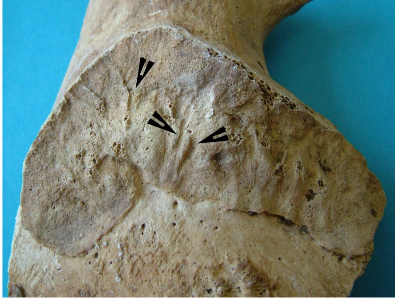
Figure 2: Auricular surface showing 'Groove' feature.