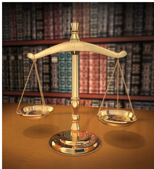
Figure 3: Scales of Justice

unhelpful, and may feel that if they did not consent, their relationship with their physician might be affected, which in turn might impact negatively on the care of their infant. Thirdly, parents' decisions may be affected by a researcher's vested interest in the project. For example, a researcher could have a financial or professional interest in the research and this may influence how information is conveyed. He or she may paint the research in a particularly positive light and stress the possible benefits, while downplaying the potential risks.