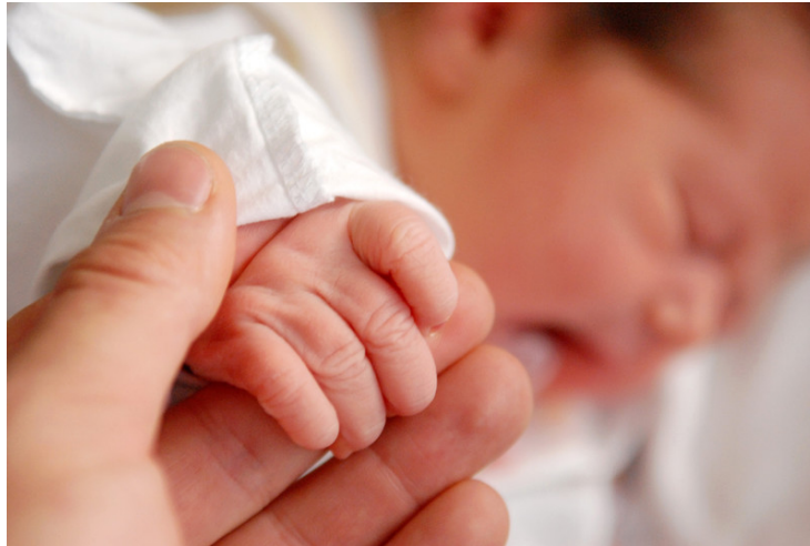
Figure 2: Neonate

under the age of consent. Many of them were institutionalised and orphaned and, thus, lacked parents to make decisions in their best interests. Jenner also deliberately infected healthy children with a disease-causing substance, which was not for their benefit but for that of others. Throughout his experimentation, there was no emphasis on the role of informed consent or the protection of the rights of research subjects.