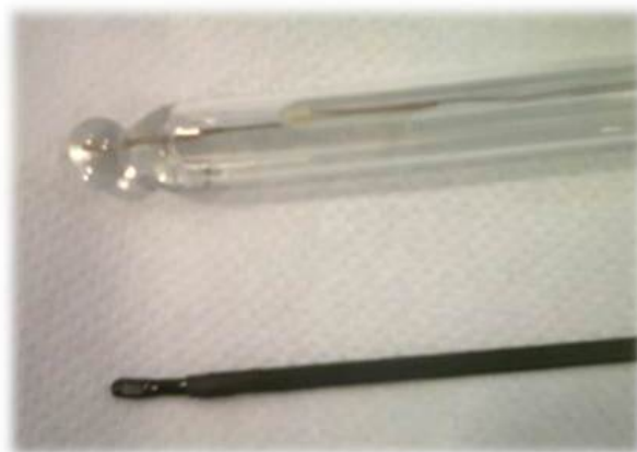
Figure 2: Comparison of a traditional pH glass electrode (above) and an ISFET pH probe with the ISFET sensor on the probe tip (below).

A planar sensor will be used to replace the traditional conductivity probe. An example of the dimensions of the sensor to be used, such as the one in Figure 3, is 15 mm x 5.5 mm x 0.65 mm, which is approximately half the size of a postage stamp.