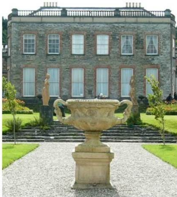
Figure 1: Bantry House, Bantry Bay, Cork. The central block is the oldest part of the house, to which the 1st and 2nd Earls added.