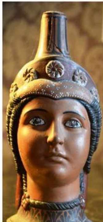
Figure 5: Giustiniani: Elegant Egyptian head Cork: Bantry House.