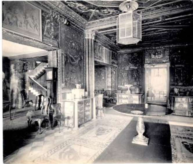
Figure 4: UCC: BL/EP/B/3557 Bantry House entrance hall as it appeared in the late 19th century. Note the painted floor tiles from Giustiniani, Naples.