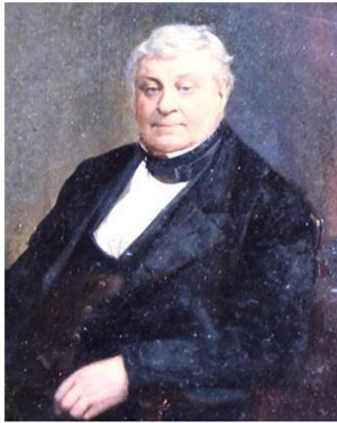
Figure 3: Richard White, 2nd Earl of Bantry, Lord Berehaven. Image: Seana Vida Farrington.