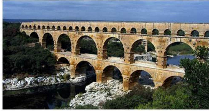
Figure 7: Pont du Gard, Roman Empire.