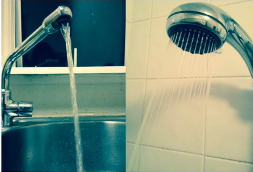
Figure 1: Tap water flow and shower streams.

mance. Hence, we need to design a smarter scheme to deliver ultrasonic Wi-Fi. My work has focused on making the most efficient sound transmission scheme against the difficulties of the acoustic environment.