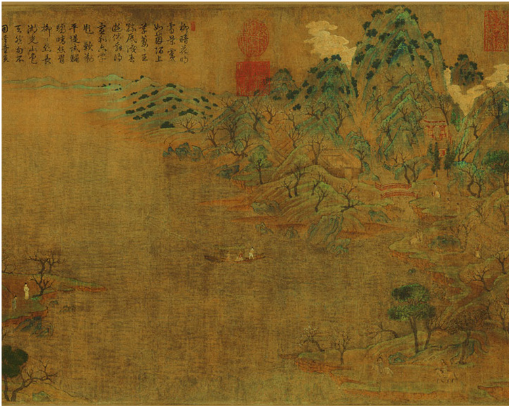
Figure 1: Detail from Zhan Ziqian, 'Strolling about in Spring', ink and colours on silk, Palace Museum, Beijing.

During the Sui and Tang dynasties landscape painting achieved an unprecedented popularity due to the 'Green-Blue' landscape style inaugurated by Zhan Ziqian (about 550-600) and continued by Li Sixun (651-716) and his son Li Zhaodao (about 670-730). The only left painting of Zhan Ziqian is 'Strolling about in Spring'.