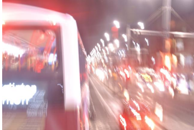
Figure 3: Edinburgh Lights: Camera Manipulation whilst sitting on a moving double-decker bus