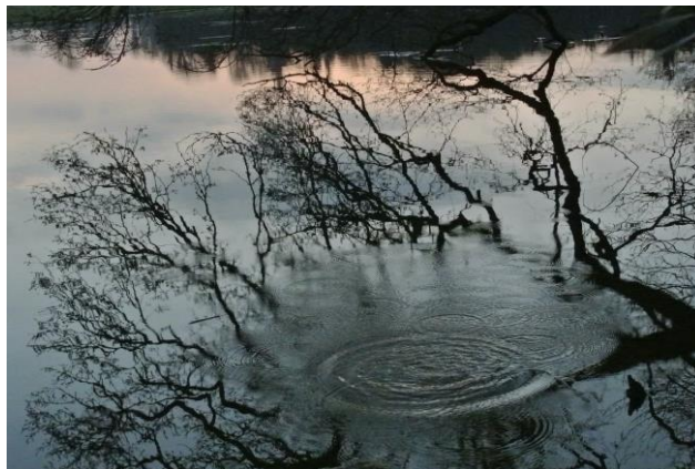
Figure 6: Reflections Reflected on Jubilate Deo