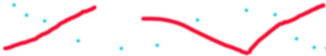
Figure 1: Dots and Lines Graphic Score

From this, I do not know the exact pitches the performers will play, but I know that I will hear a series of short notes from the performer of the blue dots, and a series of long notes from the player of the red lines. If I ask the performers to read from left to right, I have even more control. I could give precise performance instructions on some occasions, or alternatively, I could just hand the performers the picture to improvise on and we would discuss the implications of the performance thereafter. Both methods produce interesting results.