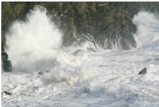
Figure 2: Rocky Bay during a winter storm