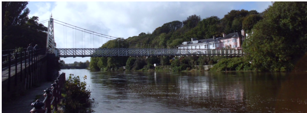
Figure 1: Daly's Bridge, River Lee, Cork.

There are only three suspension bridges in Ireland; at Birr and Kinnitty Castles, both in Co. Offaly, and Cork's own Daly's Bridge. The 87m meter long steel suspension bridge spans the River Lee, shown in Figure 1, connecting the Mardyke and Sunday's Well areas just east of Cork city centre. Constructed in 1926 to replace a ferry crossing at the location, it was manufactured by David Rowell & Co. Ltd. of London to the specifications of then Cork City engineer Stephen William Farrington. Named Daly's Bridge for James Daly, a wealthy benefactor of the project, today it is better known locally as 'The Shaky Bridge' for its perceived 'shakiness'.