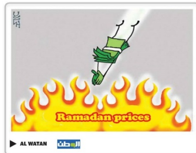
Figure 5: Cartoon 4: Source — Khaled republished in Saudi Gazette

The cartoon displays a scene in which some green notes are depicted as a moving creature jumping into flames of fire. As the flames of fire are identified as ‘Ramadan prices’, the