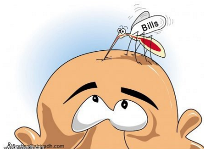
Figure 2: Cartoon 1: Source — Rabea published in Al-Riyadh

the high bills paid for services: bills absorb one's blood . The cartoonist relied on the metaphoric expression and his imagination to design the above image. He inserted one essential verbal element 'bills' and another essential visual element 'blood' as a means to help familiar readers recall the original expression.