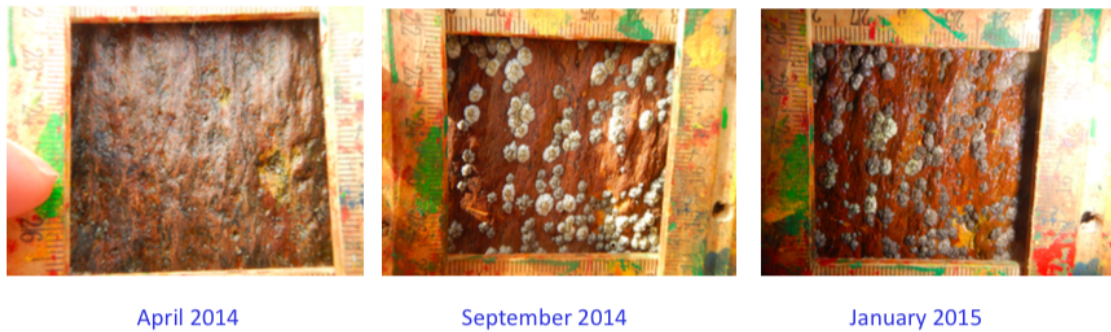
Figure 2: Photographs of the same removal plot in April 2014, September 2014 and January 2015. The invasive species is visible in September 2014 and January 2015 as the grey coloured individuals, while the natives are more white in colour.

species lying dormant in our cold temperate waters, surviving but not becoming abundant until environmental conditions become more suitable for them.