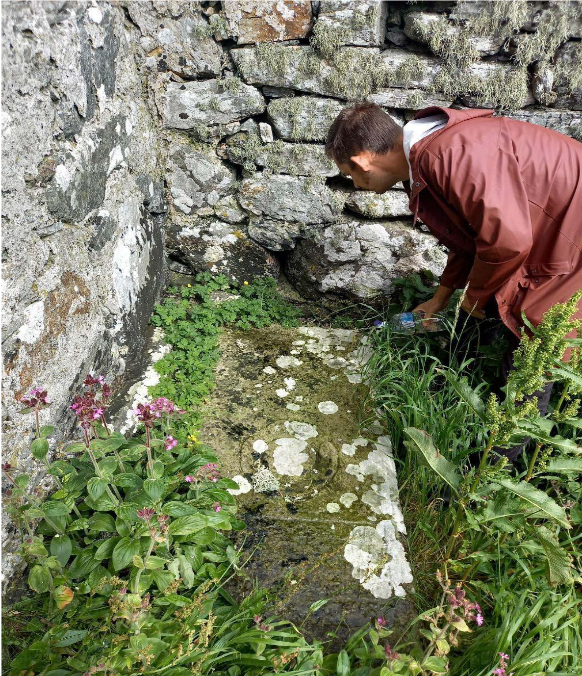
Figure 5: Bart Holterman cleaning the grave of Segebad Detken, a merchant from Bremen who traded for 52 years with the Shetland communities and died there in 1573. The available documents show Detken's long-term involvement in the trade with Shetland and include a lawsuit about the use of the harbour of Baltasound by other German merchants. His gravestone on Shetland highlights how traces of trade are still visible above ground today.