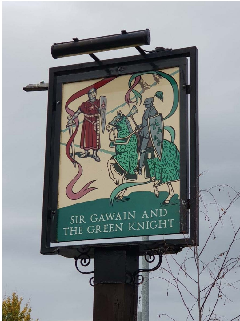
Figure 6. Pub sign, Sir Gawain and the Green Knight, Golftyn Lane, Connah's Quay, Deeside, Flintshire (pub permanently closed at the time of writing).

that make up the Hilbre archipelago. But however fanciful, speculative or far-reaching, such intertidal navigations are nevertheless deeply embedded in the folklore and mythology of the Deeside region (Fig. 6).