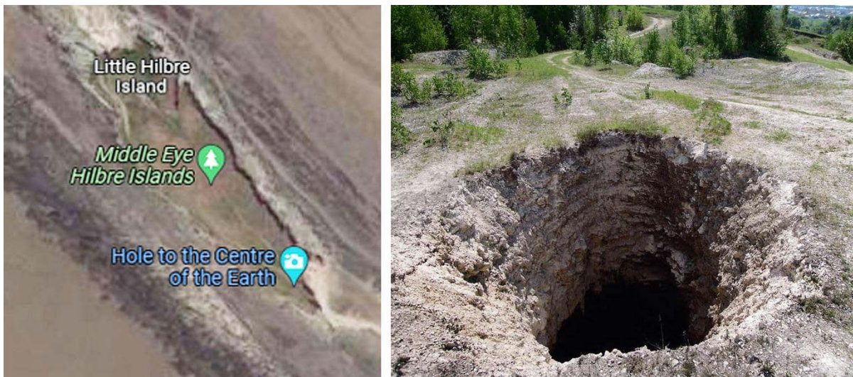
Figure 1. Images used in newspaper articles reporting on the discovery of the ‘Hole to the Centre of the Earth’ icon on Google Maps. The image on the right, showing an actual hole in the ground (location not known), was used to illustrate an article about the story in Chinese news media ( China Times 2021).

reckoning, the island functions as a gateway, portal (Hay 2006: 23), or staging post on journeys bound for Elsewhere, whether these be ‘real world’ geographies mobilised by the island’s constitutive islandness or other spaces procured by an ‘island imagination’ (Baldacchino 2004: 274) pitched towards horizons that lie beyond. Either way, it can be argued, islandness presupposes a consonant fictiveness.