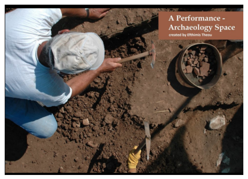
Figure 1: The Performance-Archaeology online space, which has been created by Efthimis Theou. E. Theou facilitated the Gavdos House performance and participated in the Koutroulou Magoula performance experiment

is in these actions, or 'performance(s)' that archaeology actually exists..." (Joukowsky n.d. )