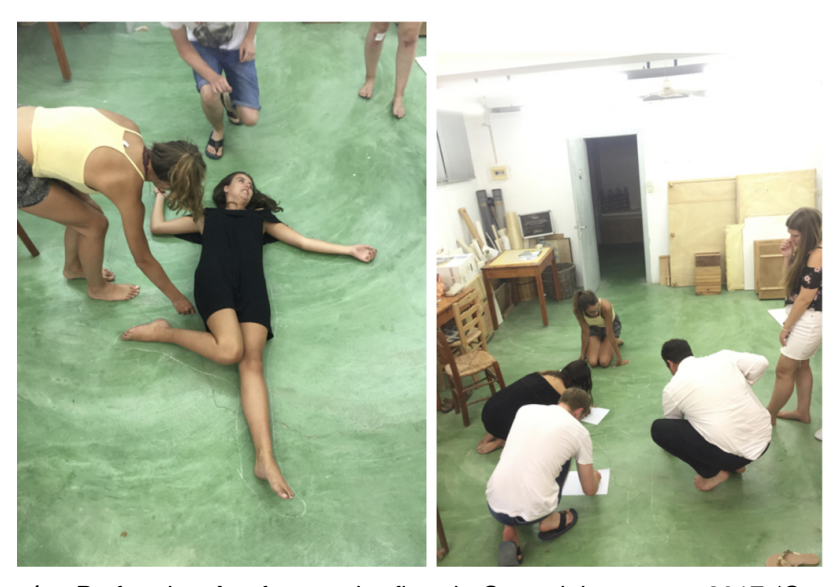
Figure 4: Performing Artefact on the floor in Santorini, summer 2017

The 'Performative Archaeology' workshop took place over the last five days of the 21 in total that the fieldwork lasted. The reason why the drama workshop took place over the last five days was to allow participants to gain as much impetus, data, information and experience from the place and space, time, working conditions and fieldwork concept, as possible.