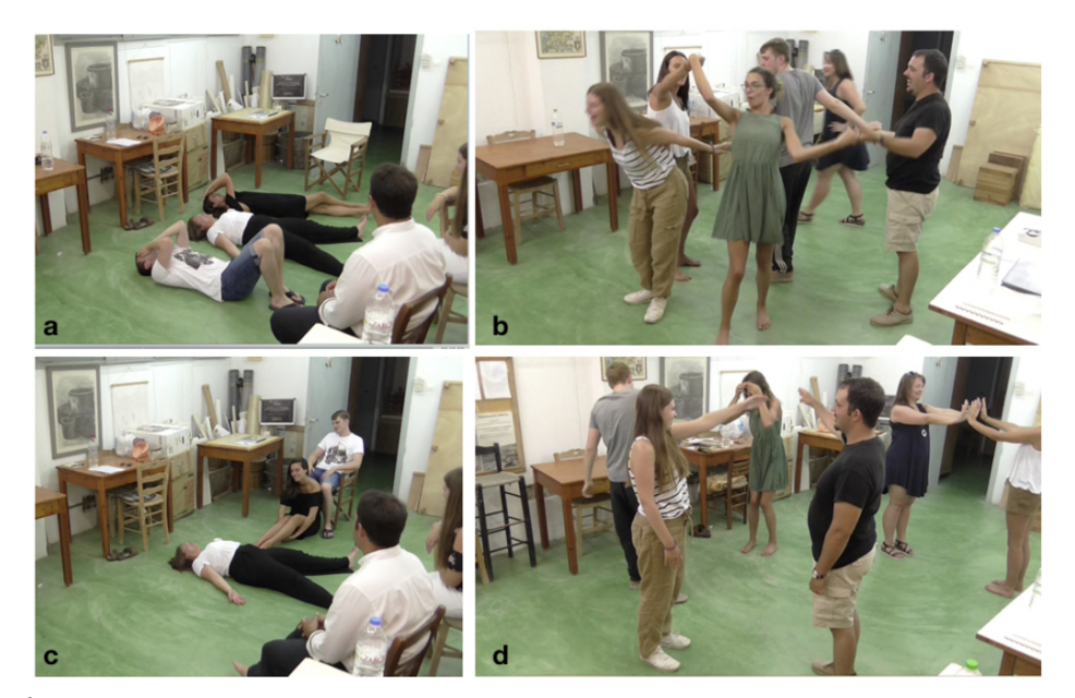
Figure 5: Snapshots from the Santorini workshops: a) and c) Who? Where? What?, b) Untangled, d) Mirror your peer

they had been through offered them new and unexplored perspectives on how to interpret archaeological data and finds.