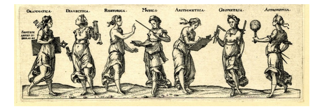
Figure 2: Septem Artes

However, what at the time was considered to constitute the 'canonical arts' underwent changes in the centuries that followed. New arts fields emerged such as music, for example, which joined other art forms to constitute the performing arts . According to Wikipedia the performing arts are commonly understood as: "forms of art in which artists use their voices, bodies or inanimate objects to convey artistic expression ...".<sup>9</sup>