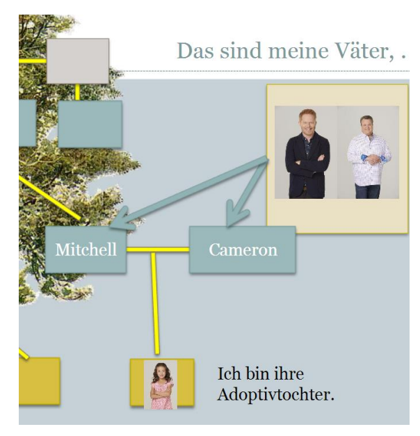
Figure 1: LGBTQ+ inclusion in family tree

A few days after the process drama lesson about smoking cannabis and drinking, Devon introduced family vocabulary using characters from the television series, Modern Family . This show features a same-sex couple and their adopted daughter (see Figure 1), as well as multiracial family members. She also included queer vocabulary not available in the textbook to give students the ability to convey LGBTQ+ identity-markers in German and normalize the topic (see Figure 2). She had used these instructional materials in the previous semester without student responses or subsequent use of the terms.