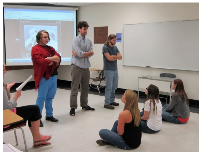
Figure 3: Student directing presentation on Dornröschen

to our usual acting/directing warm-up, but this time integrated everyone's gestures. In discussion, we then reflected on the connections between the play's themes and satirical impetus and the students' gestures. The capstone to our consideration of Jelinek involved a multimedial directorial assignment due on the third day. I tasked students to create a voice recording of a passage or a collage of citations in two different voices and provide an image that they associated with the text. After posting their voice recording, they were required to compose directions for a choreographed sequence with three female and three male actors (3 princes and 3 princesses) that would be performed simultaneously with their voice-over recording, a projection of the image they associated with the text, and a song or soundscape of their choosing. In the following class session, each student presented their multimedial interpretation of Jelinek's text by directing others from the class. Over the 75 minute session, we witnessed a wide range of critical reflections on Jelinek's text. Each student was able to employ a wide range of theatrical signs in an interpretation that emphasized neither character nor plot, but rather the theater as a canvas for representation and reflection beyond drama.