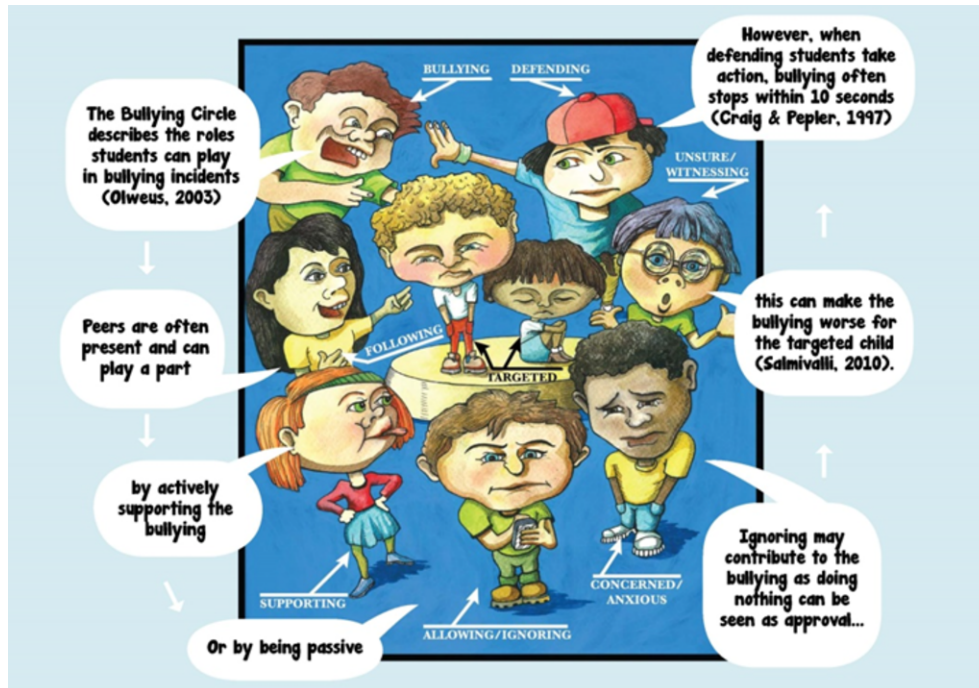
Figure 1: Fig. 1. The Bullying Circle with participant players (adapted by Donohoe and Dummigan, 2015)

for teachers who might intervene. On the other hand, they may be defenders, who try to stop the bullying. Furthermore, these roles can be fluid (James 2010) as students can play multiple roles in the bully/victim continuum such as engaging in bullying behaviour in one incident, being targeted in another or intervening (Salmivalli 2010). Figure 1 below depicts these potential roles: